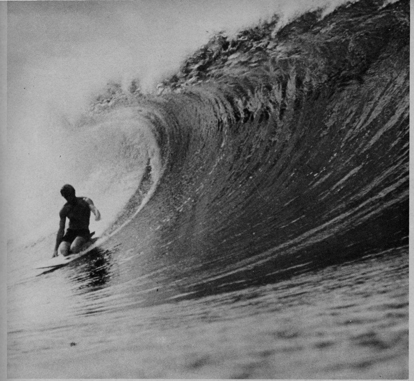
A seven foot curling tube seems like ten to twelve feet to this knee rider, who is now praying mightily for speed! Although much shorter and lighter, having less momentum, paipos frequently speed past surfboards on Hawaiian waves.