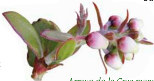
Arroyo de la Cruz manzanita

The park is home to rare and endangered plants, including maritime ceanothus, dwarf goldenstars, Arroyo de la Cruz manzanita, adobe sanicle, Hickman's onion, Blochman's dudleya and Arroyo de la Cruz mariposa lily. Prairie grasslands are among the area's native plant communities.