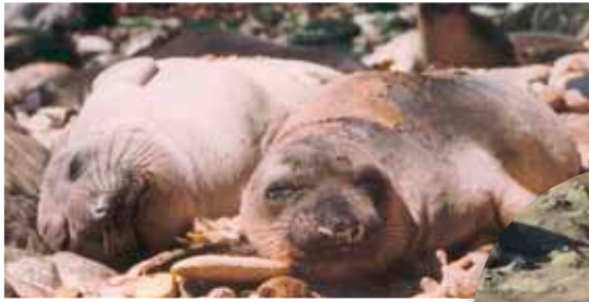
Young elephant seals napping At right: adult male elephant seal