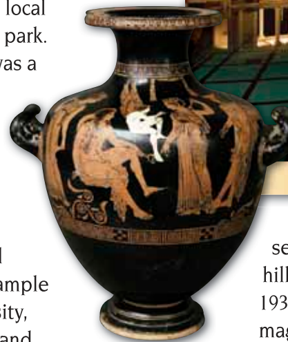
Greek hydria, 5th century B.C.

The Mediterranean Revival-style home houses a collection of art from all over the world. In addition to his fine arts collection, William Randolph Hearst established landscaped gardens and a private zoo on the property. Descendants of some of the zoo animals, including zebras, can sometimes be