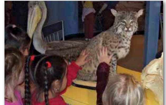
Coastal Discovery Center exhibit

California State Parks is committed to making certain that all visitors have access to the natural and cultural resources of the parks. Accessibility is continually improving. For