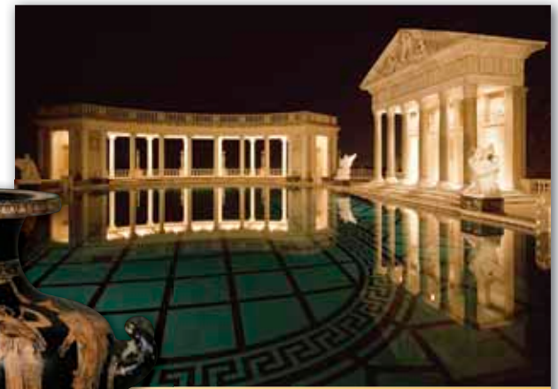
Neptune pool at Hearst Castle

seen today grazing on the green hillsides. During the 1920s and 1930s, famous guests arrived at this magnificent country house by car, train and airplane.